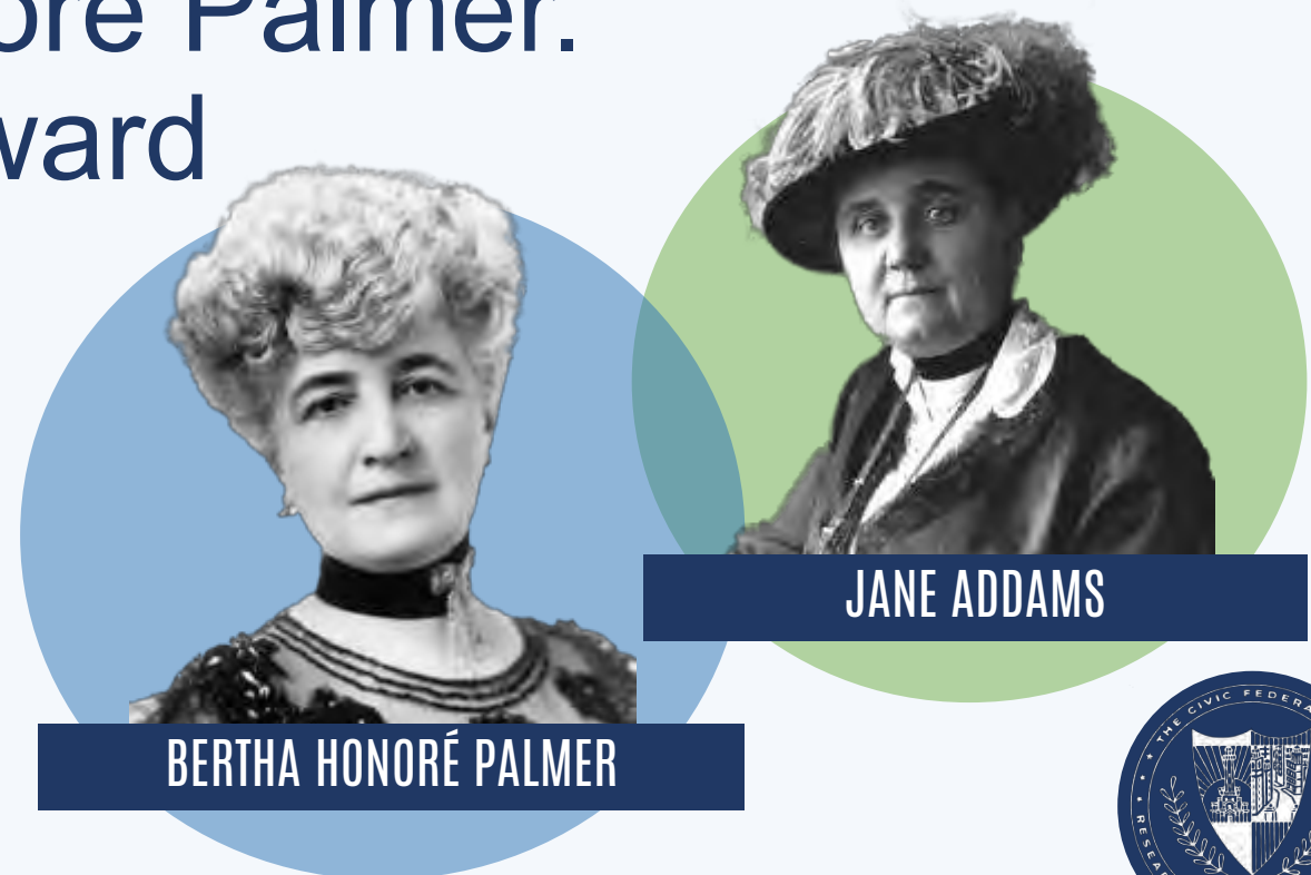
BERTHA HONORÉ PALMER

The Addams-Palmer Award is named for two outstanding Chicago women who helped form the Civic Federation – Jane Addams of Hull House and Bertha Honoré Palmer. The Addams-Palmer Award is given in recognition of outstanding civic involvement by a Chicago institution.